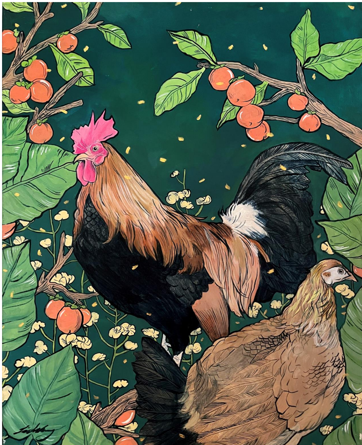
EDEN 2018 60 cm X 75 cm Acrylic on Canvas